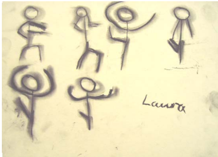
Laura's Movement life drawings from Cave Painting Workshop Yr 4

£4 for a 1 and a half hour session per child based on 10 pupils in a club.