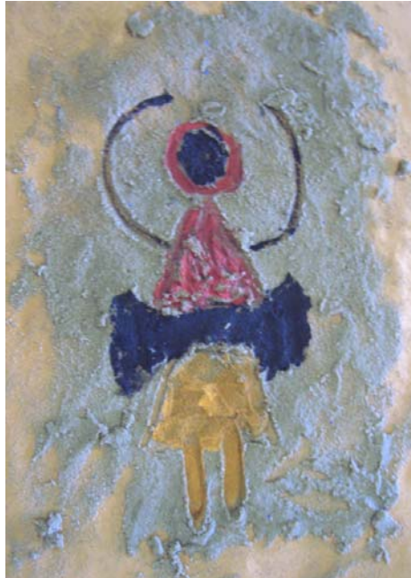
Rebecca's Cave Painting Yr 4 from Cave Painting Workshop

Overall I will be giving guidance and support in a project they can take full credit for.